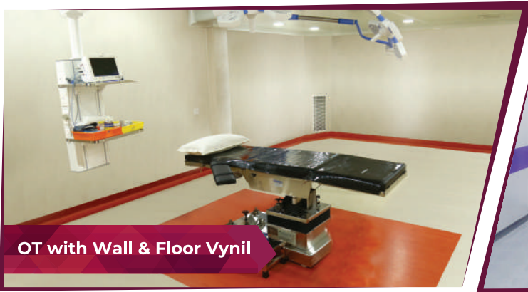
OT with Wall & Floor Vinyl