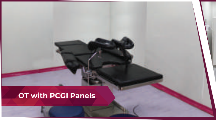
OT with P CGI Panels